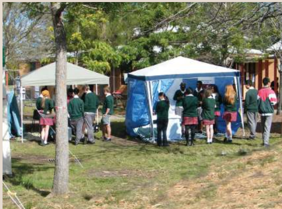
2013 Refugee Camp in my School at Menai High School

An excellent opportunity for students to not only understand the facts about refugees but to imagine what it would be like. This can all happen in your own school grounds. Allow local schools to wander through your camp. Let the media know about your innovative program. Invite a refugee to speak about their experience.