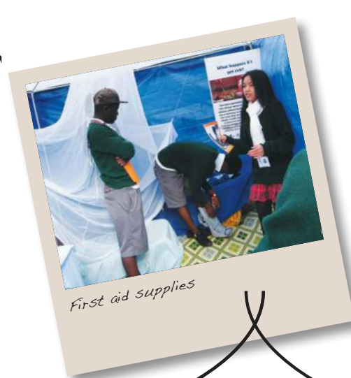
First aid supplies