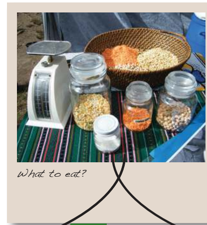
What to eat?