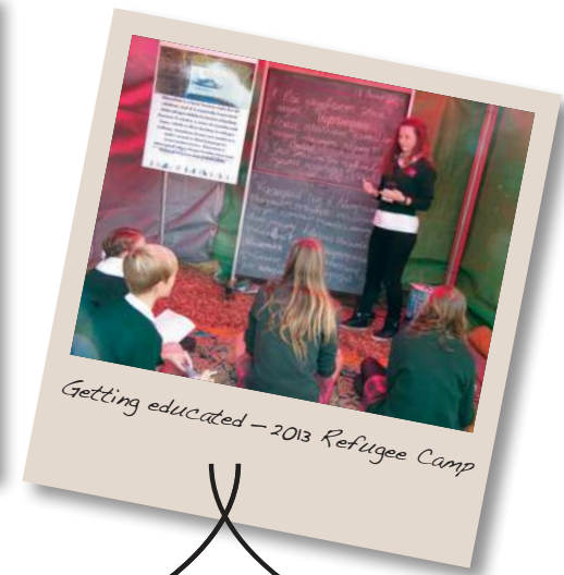
Getting educated - 2013 Refugee Camp